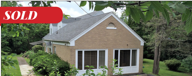
SOLD Scranton Former Geisinger administrative offices sold to a private party. Consisting of 4,213 square feet (+/-) on two floors. *