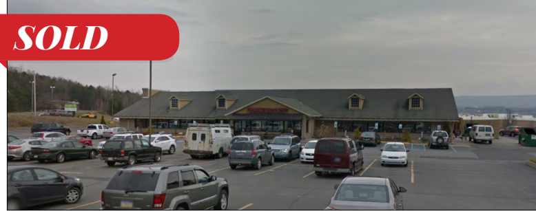
SOLD Scranton 10,500 Square foot former restaurant on 2.75 acres on the Viewmont Drive retail strip. New home to AAA. **