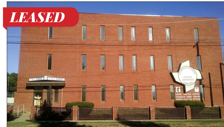
LEASED Dunmore Professional Building. 691 square foot; 2,128 square foot; 719 square foot for use as medical offices. *