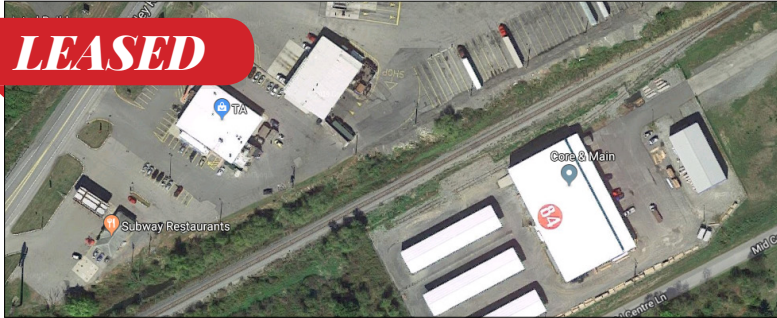
LEASED Milesburg 20,000 square foot of industrial warehouse flex space was leased to Core & Maine, a Florida company.**