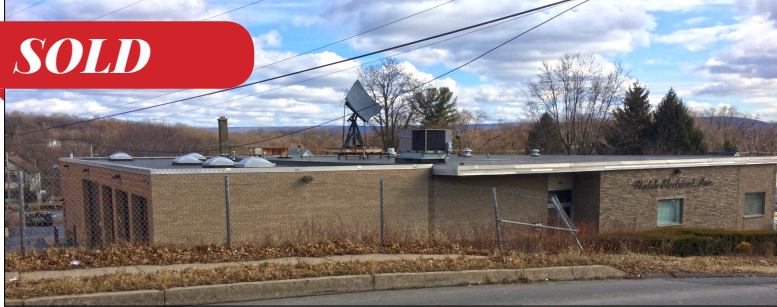
SOLD Scranton 11,442 Square foot commercial building consisting of offices, warehouse and storage areas. *