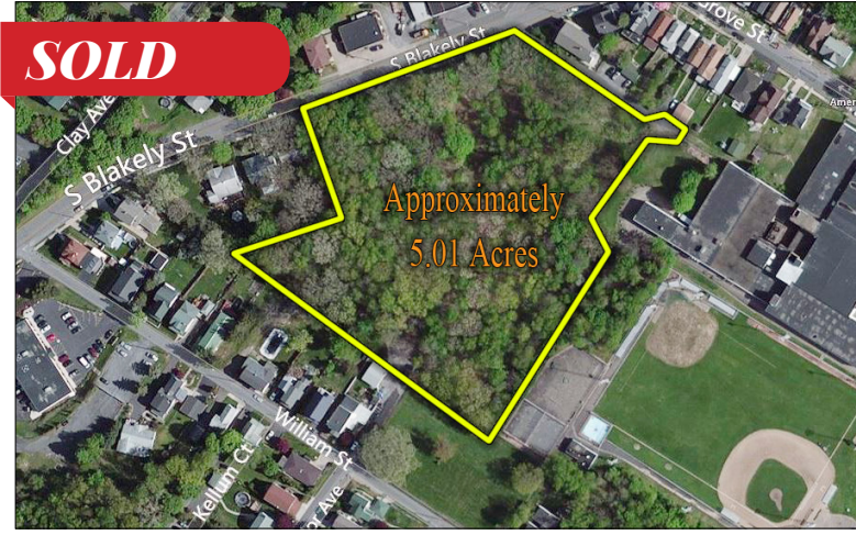
SOLD Dunmore Five acres of undeveloped land with utilities sold to Dunmore Borough.