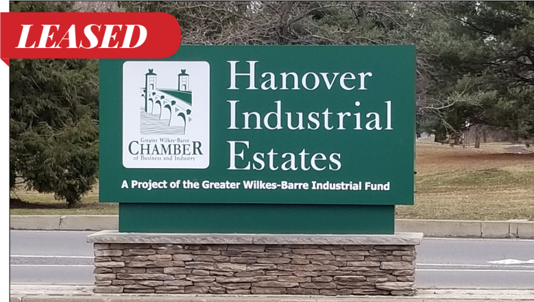
LEASED Hanover Industrial Estates, Hanover Township 10,000 Usable square foot of industrial flex space leased to a New Jersey company and 140,000 usable square foot to out of state company**