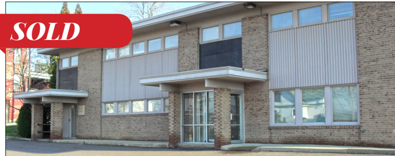
SOLD Wilkes-Barre Former medical office building consists of 9,500 square feet on two floors each at grade on a .85 acre lot. *