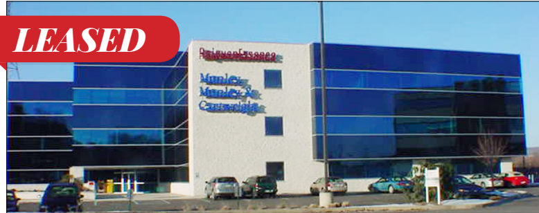
LEASED Waterfront Professional Park, Wilkes-Barre 5,200 Square foot of professional office space.**

*HCRE represented landlord/owner **HCRE represented tenant/buyer