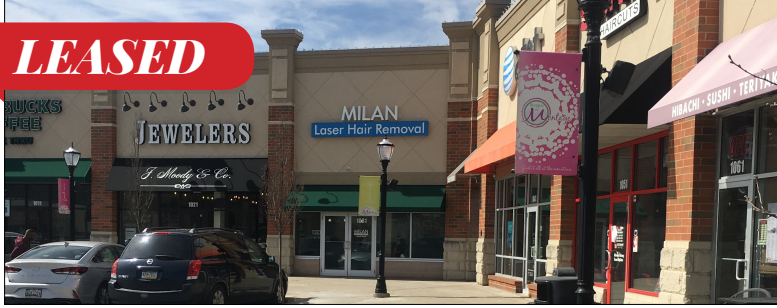
LEASED Shoppes at Montage, Moosic 1,300 Square foot retail store front to Milan Laser. **