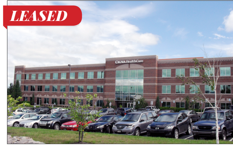
LEASED Glenmaura Corporate Center, Moosic 11,693 Rentable square foot of Class A office space at 53 Glenmaura National Boulevard. **