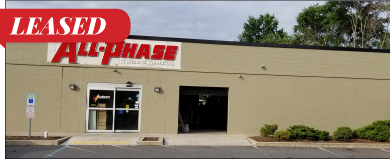
LEASED Scranton We represented the owner and assisted Friends of the Poor in leasing 9,440 square foot warehouse/office/retail.